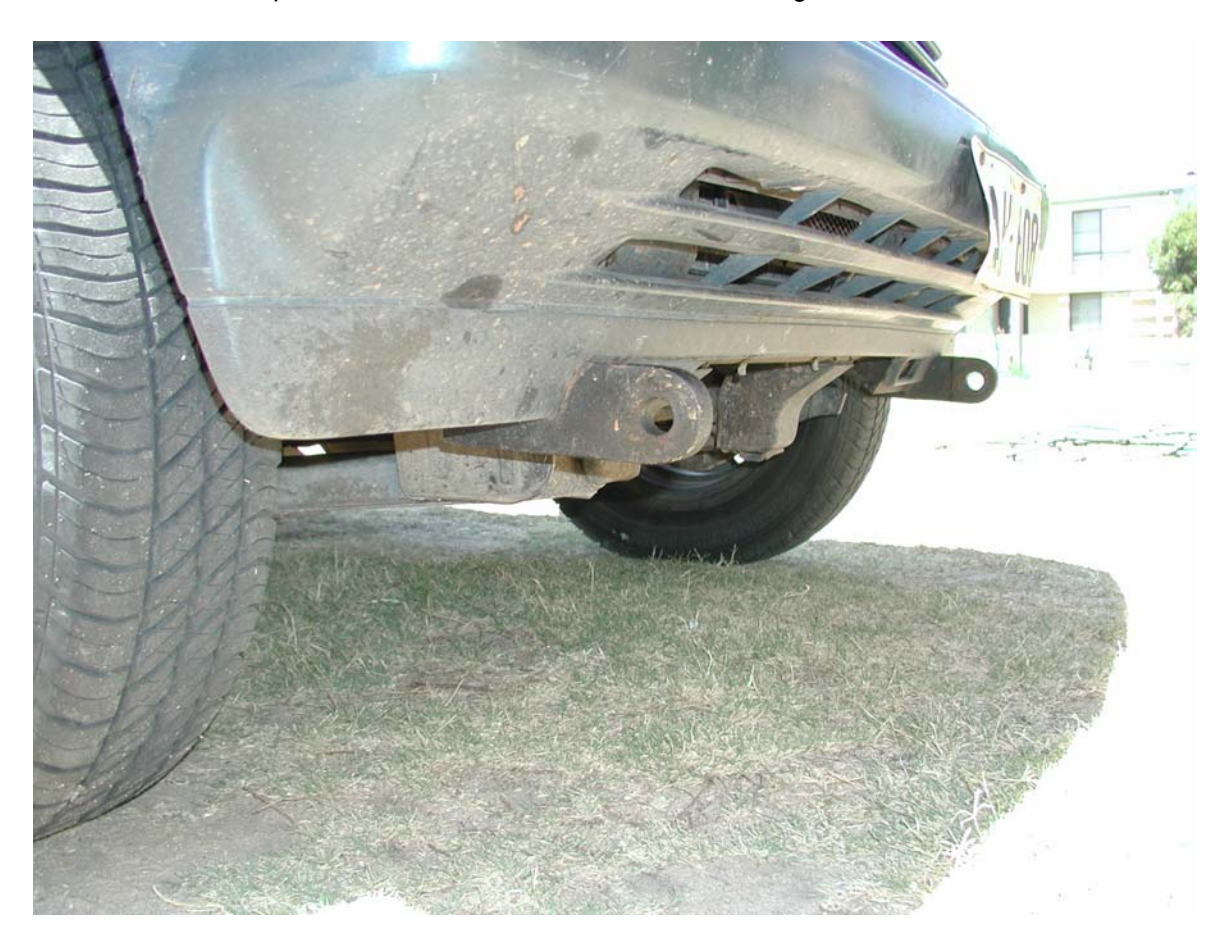
Safety chains for towed vehicles with a GVM of up to 3500 kg

Towed vehicles with a GVM of up to 3500 kg must be equipped with safety chains/cables complying with AS 4177.4-1994 of the appropriate size for the towed vehicle GVM as detailed in Table 1 below: